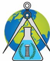
Exhibit & Presentation Guidelines (grades 6-12)